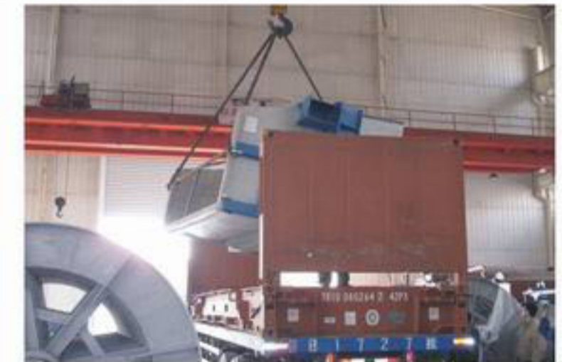
Disc filter into flat rack container