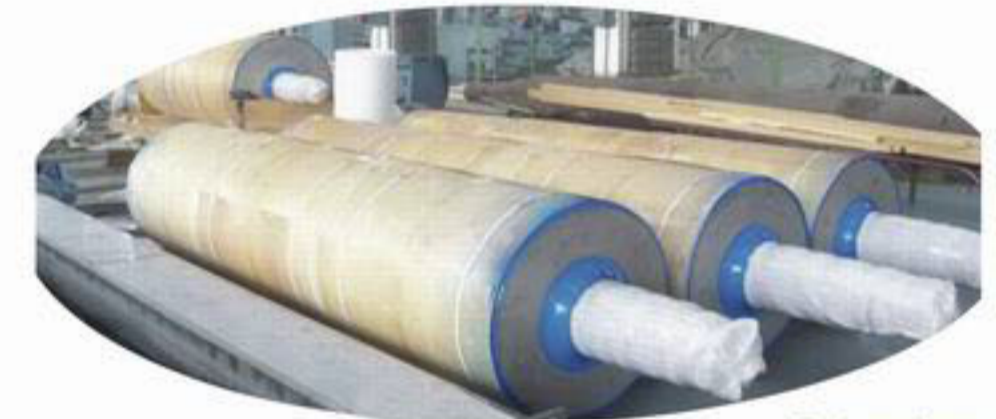
Package for press roll