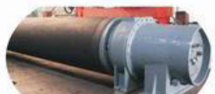
4 Suction pick up roll