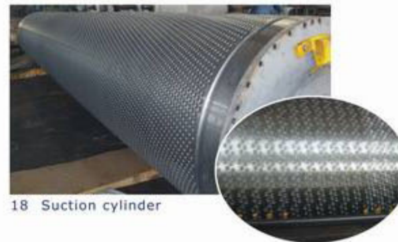
18 Suction cylinder