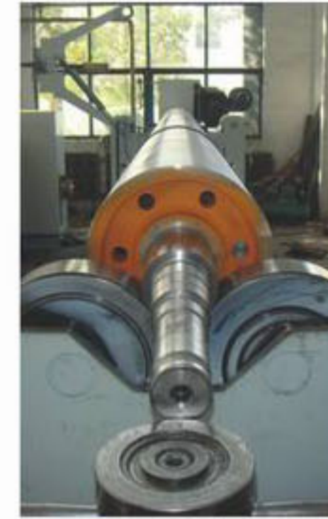
Dynamic balance for guide roll