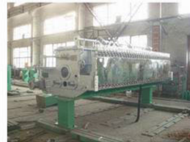
Pre-assembly for 3200 paper machine