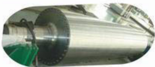
8 Press roll