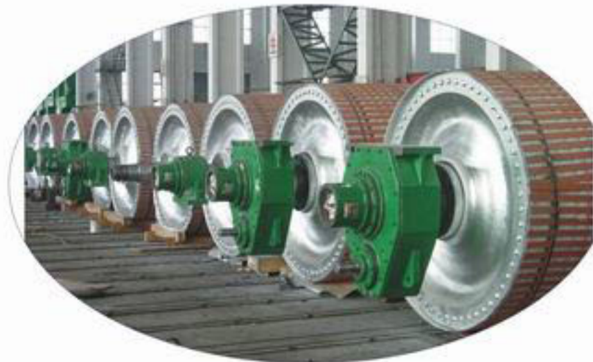
Package for drying cylinder

Packaging material will be seaworthy or airworthy or according to client's requirement For large volume products, they will loaded into containers in our workshop to keep safety delivery.