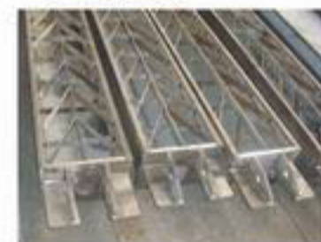
5 Water box