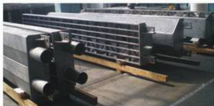
13 Suction box