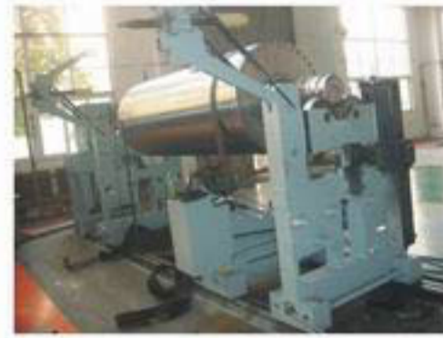
Dynamic balance for press roll

Roll max. face length: 10000mm Drying cylidner max. face length: 8700mm Yankee max. dia.: ø3660mm Material certificate, Inspect report will be provided together with good delivery