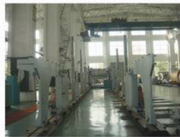
Pre-assembly for special paper machine