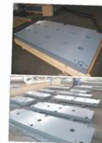
24 Sole plate