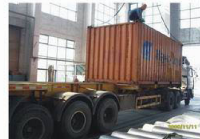
Rolls into 20' container