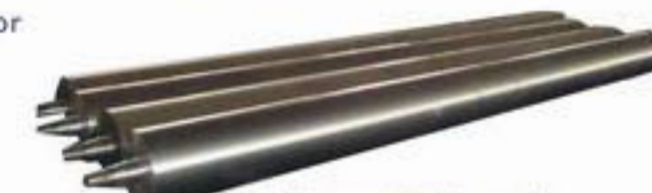
20 Chromeplating roll