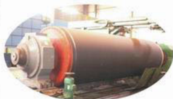
14 Blind drilled press roll