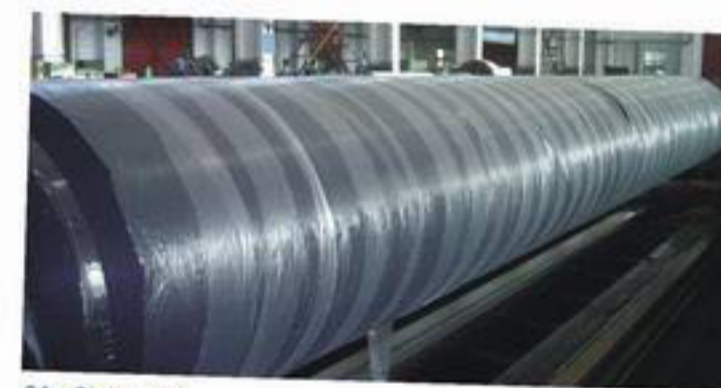
21 Sizing roll