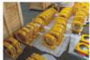
3 Bearing house