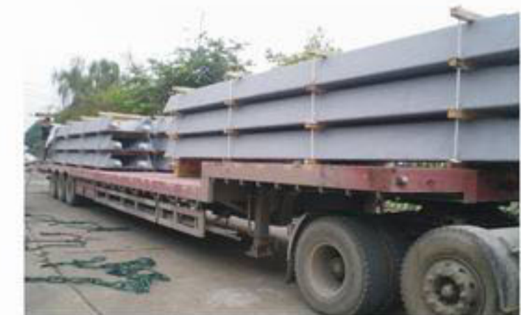
Doctor loaded on a truck