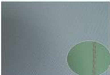
2 Forming wire