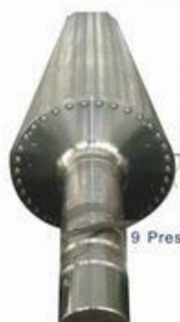
9 Press roll