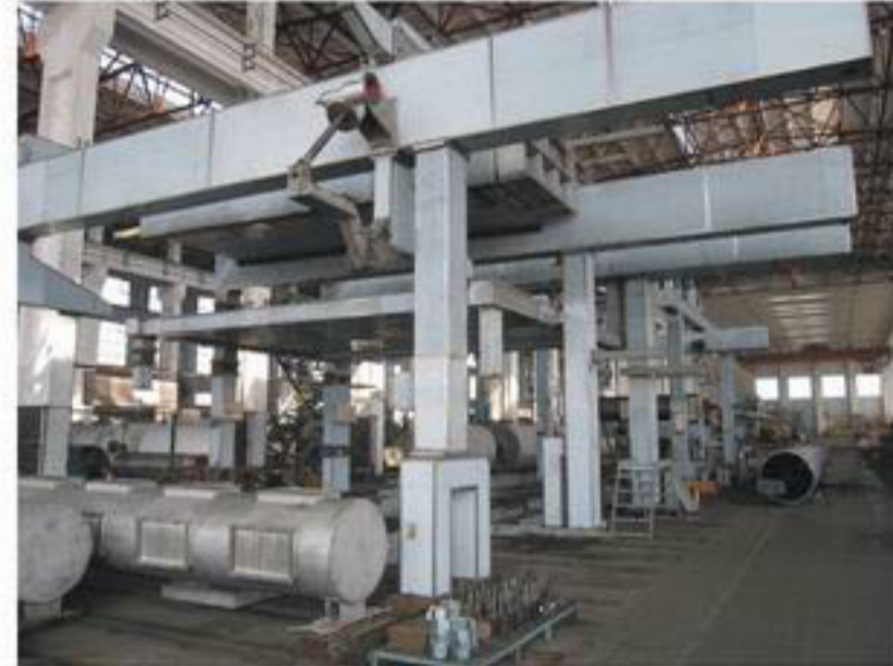
Pre-assembly for 4500 paper machine