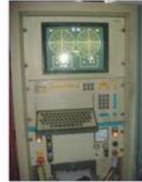
Display on the mornitor for dynamic